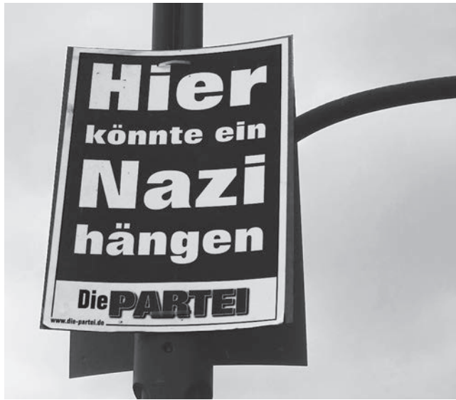
FIGURE PRELUDE.5. A sign on a lamppost in Berlin in August 2016: “Here a Nazi could hang.”

and postcommunist lustration to ask whether we can hold individuals responsible for inaction in the face of tyranny. When I first drafted the text of this fictitious future interview with German immigration officials, Donald Trump had not yet won the Republican nomination, and most of my early readers thought the story unrealistic. No one would remember Trump, they said, when the book came out, so I created a different character, one young enough to declare himself president for life in my little alternative universe. And finally, I could not resist the opportunity to include a political allegory, a fable exploring the vulnerability of democracy in the style of other politically charged animal fables of the past. Just as the popular stereotype of communism is rarely uncoupled from the state repression of the twentieth-century experience of it, today I fear that the democratic ideal is becoming inseparable from the social chaos neoliberal capitalism has wreaked in its name. My hope is that these essays and stories provoke discussion and debate; if I haven't angered someone out there, I'm not doing my job.