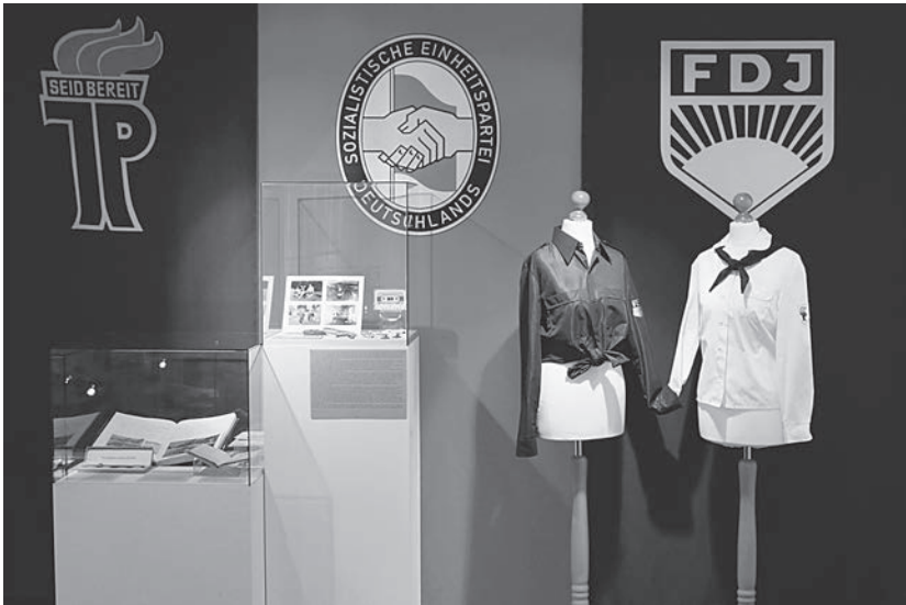
FIGURE PRELUDE.2. Items from the East German Freie Deutsche Jugend (Free German Youth).