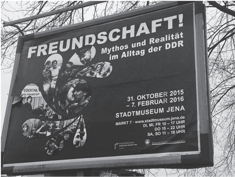
FIGURE PRELUDE.1. A billboard for the Freundschaft exhibit in Jena.