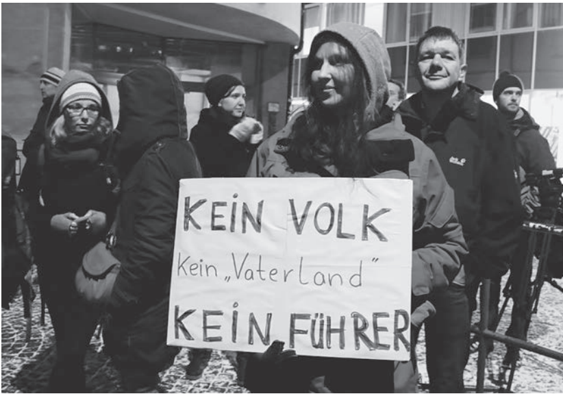
FIGURE PRELUDE.7. “No Volk, No ‘Fatherland,’ No Führer.”

suffered the same fate. It is this hypocrisy that prevents critical reengagements with the state socialist past, and which I believe has led to the swing to the far right in many former state socialist countries, and increasingly among Western democracies as well. Frustrated voters embrace nationalism as the only viable defense against the ravages of global capitalism.