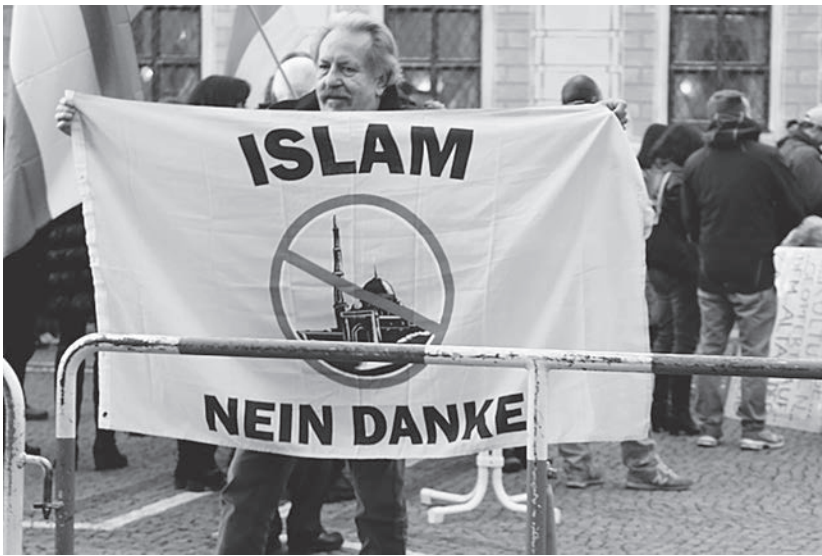
FIGURE PRELUDE.6. “Islam, no thank you.” A PEGIDA supporter in Munich in March 2016.

the uses and abuses of public memory where twentieth-century communism is concerned. Finally, part IV, “Democracy Is the Worst Form of Government, Except All Those Other Forms That Have Been Tried from Time to Time” builds on this famous quote from a 1947 speech by Winston Churchill. 7 For over seventy years, democracy has been widely accepted as the lesser of all evils. My final essay focuses specifically on the unhappy marriage of democracy and capitalism and the wholesale rejection of anything having to do with socialism or communism after the end of the Cold War, including its recognition of the fundamental contradictions embedded within capitalism. My core argument is that those desperate to rescue the democratic ideal today insist that democracy must be separated from the disenfranchisement and gross inequities of neoliberal, free-market capitalism. They admit the damage done by reckless deregulation and the rise of oligarchs and plutocrats that undermine the functioning of liberal polities today. But in the same breath, they often insist that all experiments with twentieth-century state socialism in Eastern Europe must be forever linked to the worst crimes of Stalinism. The democratic ideal must be saved at all costs, precisely because the communist ideal inevitably leads to the gulag. Thus, scholars and politicians assert that one ideal political form can be corrupted by economic realities and historical exigencies while denying that another political ideal might have