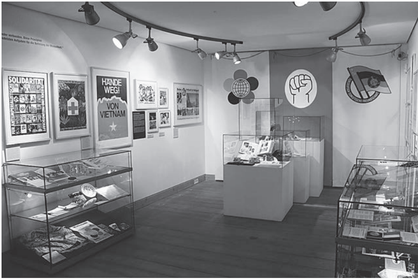
FIGURE PRELUDE.4. East German memorabilia in the Freundschaft exhibit.

Eastern Europe that are now members (or aspiring members) of the European Union. Since 1998, I have lived for about three and a half years in Bulgaria and nineteen months in both eastern and western Germany. Back in the summer of 1990, I also spent two months traveling in Yugoslavia, Bulgaria, Romania, Hungary, Czechoslovakia, and the soon-to-disappear GDR. In the last quarter of a century, I have been a frequent visitor to Eastern Europe, doing research, attending seminars, and delivering invited lectures from Belgrade to Warsaw. As I traveled through the region (often by car or train), I witnessed landscapes pockmarked with the remains of communism: abandoned fields, crumbling factories, decrepit high-rise apartment blocks. I became fascinated with the legacies of twentieth-century communism, and the essays in this book emerge from my personal desire to understand the varied politics of Central and Eastern Europe after 1989.